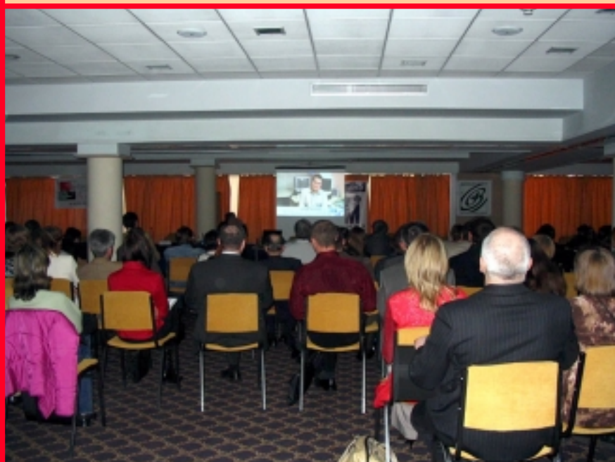
Second international forum of human rights organizations «Monitoring of human rights»

May, 23, 2005 — statement of Ukrainian Helsinki Human Rights Union «100 days of new government from human rights perspective».