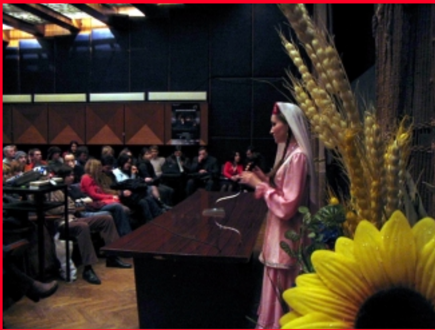
Guest from Russia addressing spectators before the film at Documentary Human Rights Day film festival