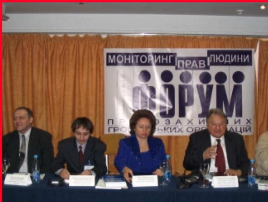
Second international forum of human rights organizations «Monitoring of human rights»

information». The campaign «Not for publishing», a part of which is this press-conference, is a result of fruitful activity of the Ukrainian Helsinki Human Rights Union, the Kharkiv Human Rights Protection Group and the «Maidan» Alliance.