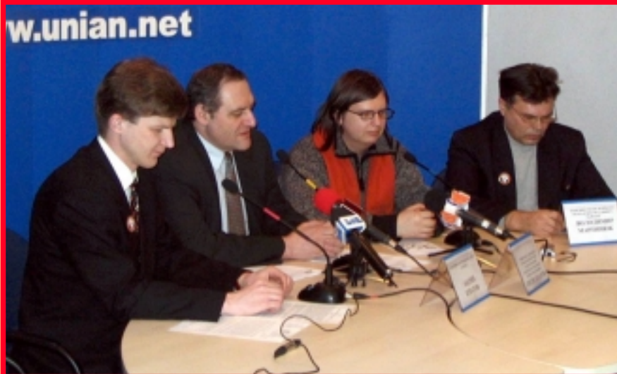
Press-conference «New Presidential Decrees «not for publishing» is a violation of freedom of access to information»

November-December, 2004 — «Monitoring human rights at the re-election in the East and South of Ukraine». Within the framework of the project 75 mobile groups in 10 regions of Ukraine worked: the Autonomous Republic of the Crimea (4 groups), Sevastopol (1 group), Kharkiv and Luhansk regions (15 groups each), Kherson and Mykolayiv regions (10 groups each), Vinnytsia, Dnipropetrovsk (Kryvy Rih), Sumy and Chernihiv regions (5 groups each). The project was realized by: the Kharkiv Human Rights Group, the Luhansk regional organization of the Committee of electors of Ukraine, the Sevastopol Human Rights Group, the Kherson city association of journalists «South», the center of regional politics research (Sumy), the Chernihiv public committee of human rights protection, the Vinnytsia Human Rights Group, the Institute of social studies (Simferopol), the Kherson regional foundation «Charity and health», the Kherson regional organization of the Committee of electors of Ukraine.