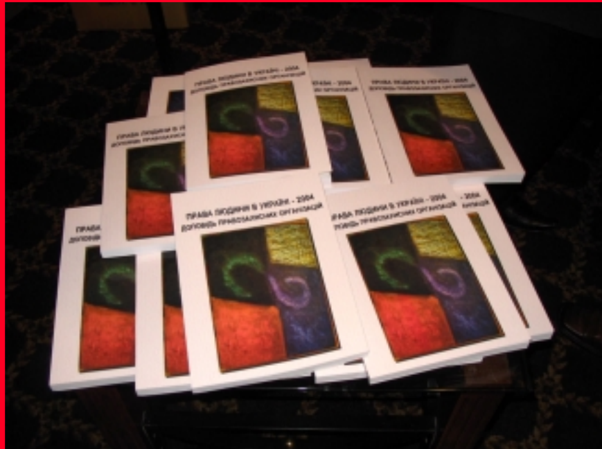
Published report «Human rights in Ukraine in 2004»

For the first time by non-governmental public organizations of Ukraine a system complex report about violation of human rights in Ukraine in 2004 consisting of 21 chapters was prepared. The report is not just stating facts; every chapter is concluded by concrete recommendations for the government on improvement of situation with one or another human right and freedoms. The report was issued in two languages — Ukrainian and English.